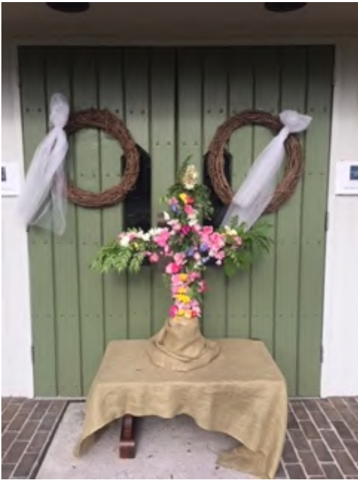
The 2020 Mother's Day Flower Cross created by the children and families of Waycross First United Methodist Church.

May 24, 2020—Seventh Sunday of Easter Title: “Living the Resurrection Life: Casting Cares” Text: 1 Peter 5:6-11 May 31, 2020—The Day of Pentecost Title: “Quiet Pentecost” Text: John 20:19-23