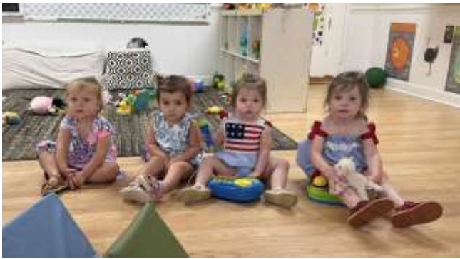
Beautiful Baby Sunday School Fun!