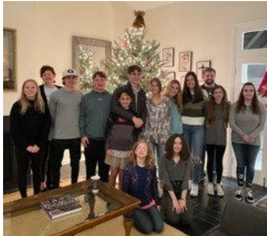
A Snapshot of the Youth Christmas Progressive Dinner!